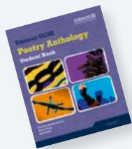
Poetry Student Book