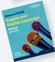
GCSE English and GCSE English Language Student Books