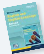
GCSE English and GCSE English Language ActiveTeach CD-ROMs