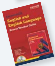
GCSE English and GCSE English Language Teacher Guides