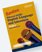
GCSE English, English Language, English Literature Revision Workbooks plus Teacher Packs