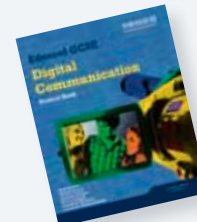
GCSE Digital Communication Student Book